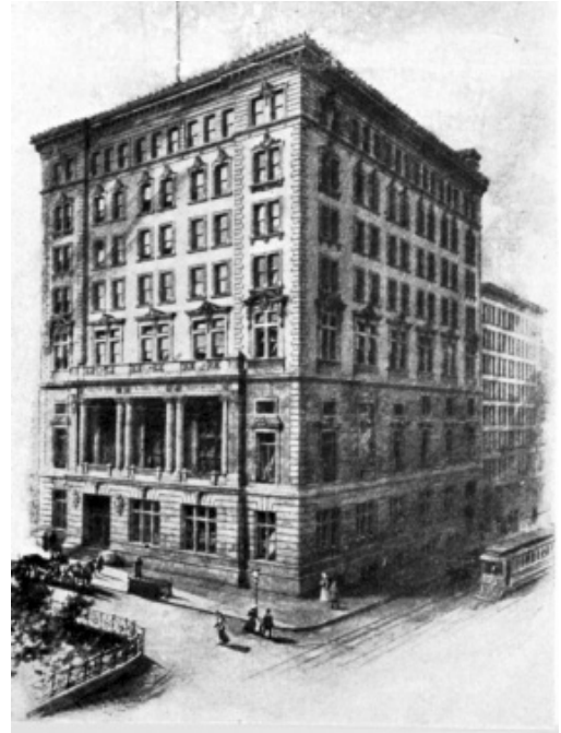
The New York City Board of Education building when it was on 59th Street in Manhattan

schools, Girls' High School was renamed The Wadleigh High School and The Mixed High School was renamed The Peter Cooper High School, to be renamed The Morris High School in 1905.