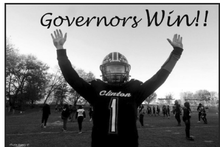
First Round of Playoffs, November 18, 2023, DWC field; DeWitt Clinton 22 Harry S. Trunan 14