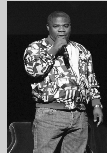
"Standing-up" for Comedy

Tracy Morgan '03 is a popular and successful stand-up comedian and actor. He was a cast member on the NBC sketch comedy television series Saturday Night Live from 1996 to 2003 and played Tracy Jordan in the NBC sitcom 30 Rock from 2006 to 2013, each of which earned him a Primetime Emmy Award nomination. In 2012, he went from nominee to winner when he was named Outstanding Actor in a Comedy Series ( 30 Rock ) at the 51st Monte Carlo Television Festival's Golden Nymph Awards.