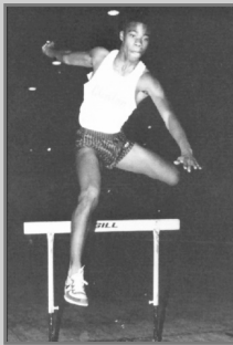
Running track for Clinton