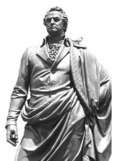
Gov. DeWitt Clinton